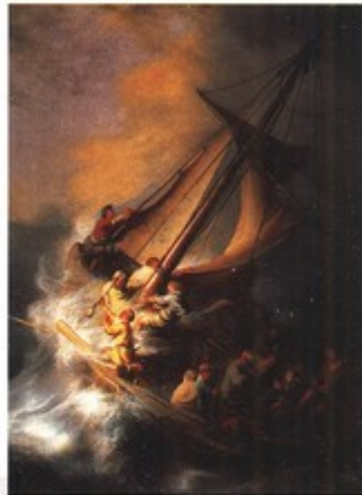
Christ in the Storm on the Sea of Galilee by Rembrandt